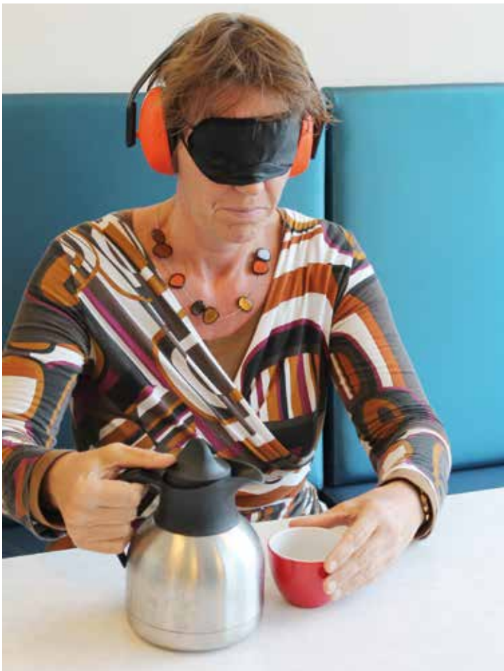
An experiential exercise clearly reveals how deafblindness affects everyday life.

To get an idea of what deafblindness means, it can help to perform an experiential exercise: blindfold yourself and limit your hearing by inserting earplugs and headphones. You will notice that the world is suddenly no larger than the extent of your reach. You will also become very aware of what you feel and what is happening in your body: the position of your body parts, your respiration, the temperature of the room you are in and the movements of air in the room, and the surfaces you are sitting on and resting your feet on. As you perceive so little of your surroundings and the visual and auditory contact with others disappears, a feeling of isolation and a need for communication and information arise: are there other people there, do they know that I am here, am I missing something, what is going to happen and what is expected of me?