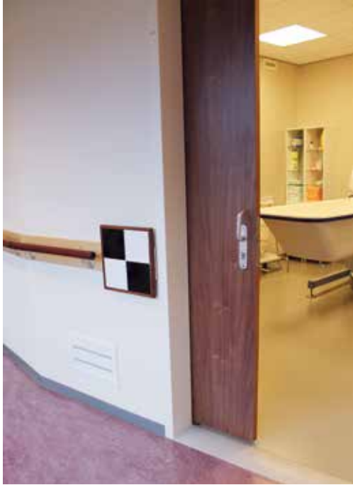
A tactile orientation board for the bathroom.

Most people have a nameplate and house number by the front door. That is a typical form of a tactile orientation board: a referral sign, used not only outside but also inside the house. A tactile orientation board is an object that indicates where a room is located. The board is hung up next to or close to the room concerned (Van Welbergen, 2009).