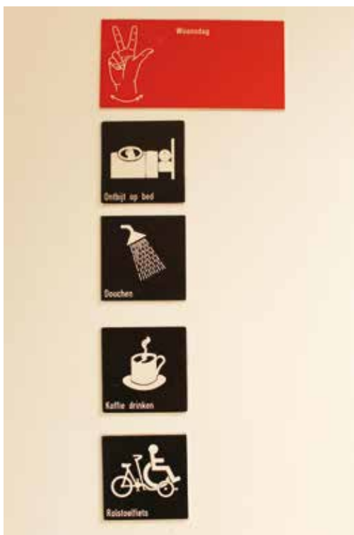
Pictograms are used to describe the day's events.

Means of communication refer to something or someone. For people with deafblindness, tangible objects used as a means of reference must have a clear connection to what is being referred to. For example, a cup refers to drinking. The connection between drinking and a cup is strong because you can easily guess the meaning from the characteristics of the reference object (the cup). If the communication level is higher, the means of communication can be more abstract.