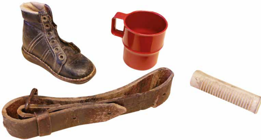
Concrete tangible objects are offered to communicate about an activity.

Communication research (see Section 4.3) using the Weerklank communication profile (Oskam & Scheres, 2005) has shown that this communication takes place at the situation level . Offering objects in a situation in which they would normally be used is the easiest form of communication. The objects offered are recognisable as they have previously been used for the same purpose (e.g. a towel, a ball from the play area, a spoon, a toothbrush). Scents can also be used for support, for example a swimsuit that still has a faint smell of chlorine can be presented to a person with deafblindness to let him or know that swimming is next on the activity programme. With people who seem to clearly understand the meaning of an object, communication partners can try extending the interval between the moment when the object is offered and the activity it refers to. In the above example, the cup was offered in the bedroom and not in the living room, where the drinking takes place. Nevertheless, the meaning was clear and the child followed.