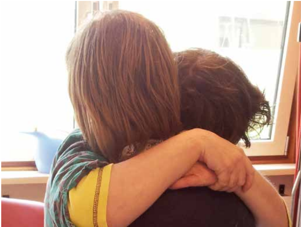
Physical contact is used to share reciprocal emotions.